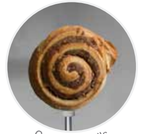
Cakes and Rolls