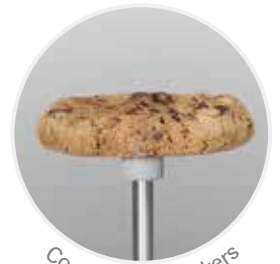
Cookies and Crackers