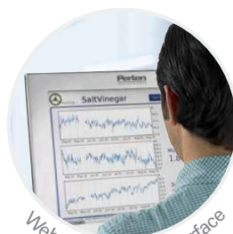
Web-based User Interface