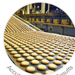
Accurate & Precise Results