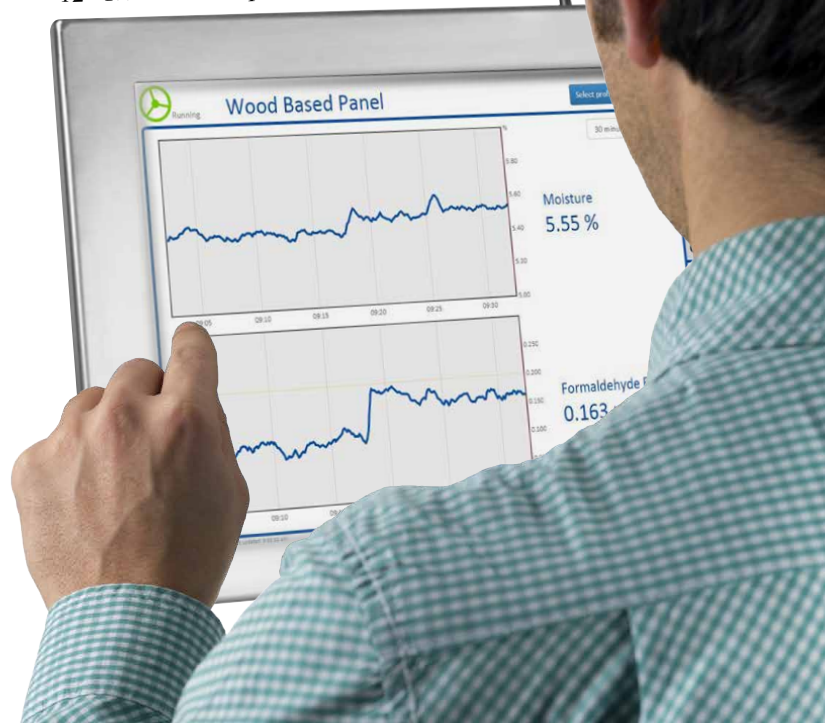
12" Touch screen Operator Interface

The junction box is typically mounted in the vicinity of the sensor and provides a convenient way to quickly install the required supplies to the sensor.