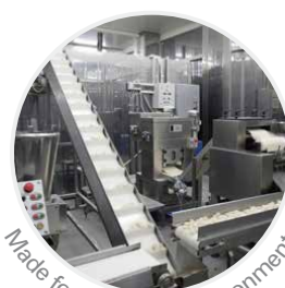
Made for Industrial Environments