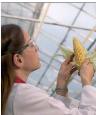
Food, feed and beverage industry

The NDA 701 is extremely versatile, being suitable for nitrogen and protein determination in several kinds of sample, in accordance with official AOAC, AACC, ASBC, ISO and OIV methods.