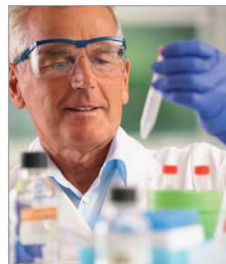
Pharmaceutical and chemical industry