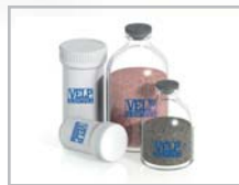
Long-life VELP Consumables

Minimum Maintenance Monitoring of consumables, no daily calibration, no use of corrosive chemicals.